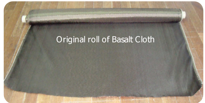
Original roll of Basalt Cloth

Well fire-resistance performance, so that it is used for as fire-retardant covering material of electric power cable.