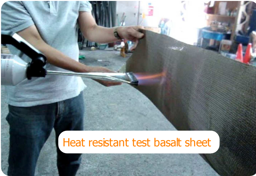
Heat resistant test basalt sheet